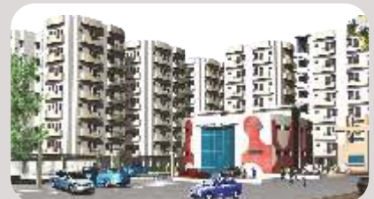
NBCC Town-I, Khekra, U.P.