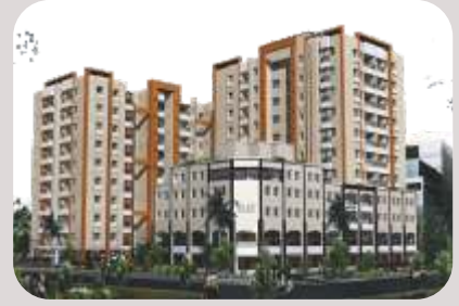
NBCC Tower, Patna