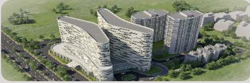
NBCC Imperia, Bhubaneswar