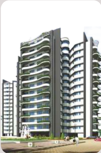
NBCC Town-II, Khekra, U.P.