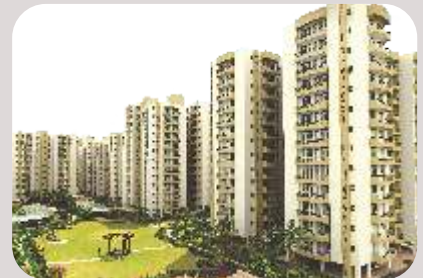
NBCC Heights, Gurgaon