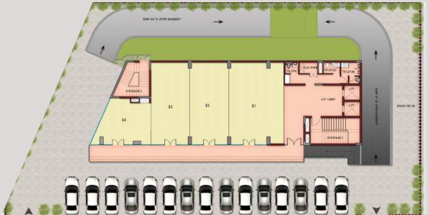
Details of Saleable Area