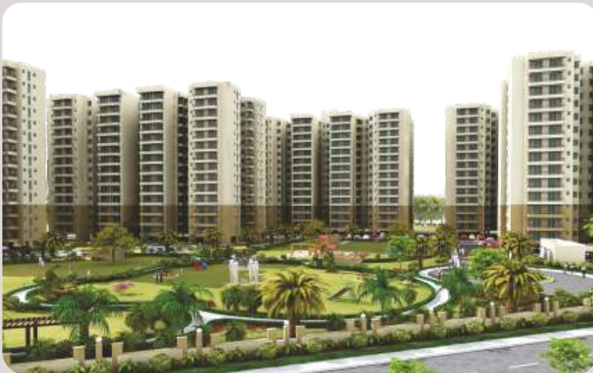
NBCC Green View, Gurgaon