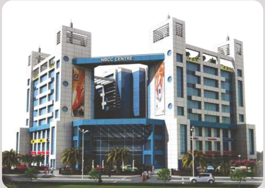
NBCC Center, New Delhi